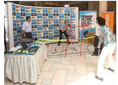
Launch of 'Tennis...Play and Stay' at the 2007 ITF AGM in Tunis

For further information, visit www.tennisplayandstay.com .